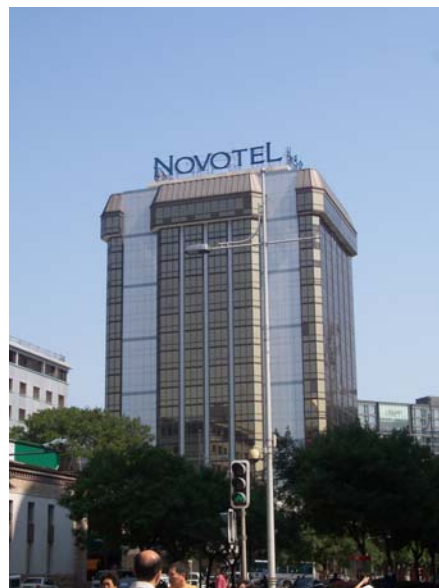
The Novotel Peace Hotel in Beijing – site of Casa Americas and Casa Mexico for the 2008 Olympic Games.