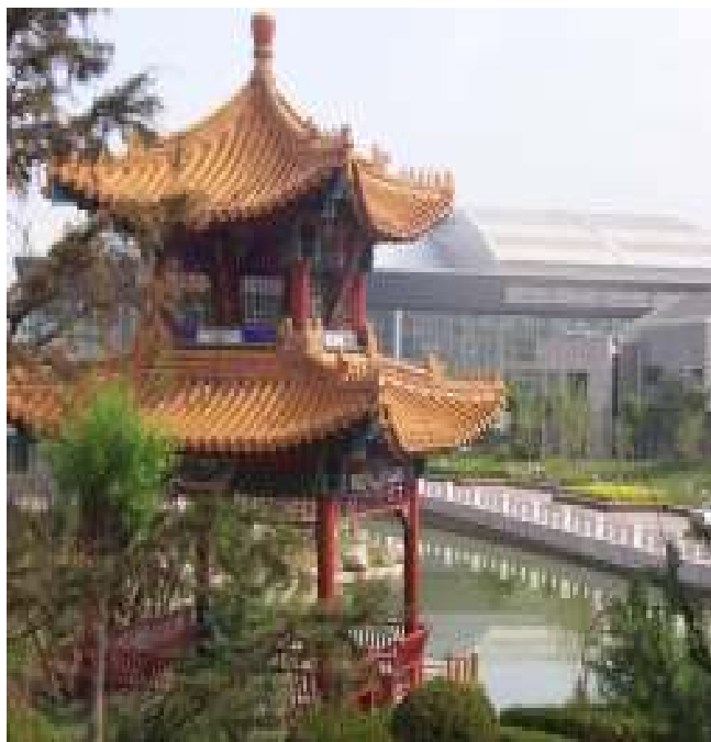
The scenic grounds of the Leisure City International Hotel Complex, a Cartan Tours anchor hotel location during the summer of 2008, with its world renown aquatic center and famous pagoda in the background

I need a car and driver for a one day trip to the Great wall - Wo Xiang zu yi liang dai siji de che qu changcheng yiriyou.