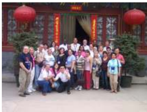
Cartan Tours and GSP personnel with its various 2008 sub-agents during a FAM trip in Beijing, China