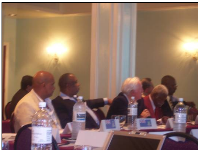
Caribbean NOC officials in full concentration at the recent CANOC General Assembly held in Nassau, Bahamas in November, 2006 listening to Rio 2007 and Guadalajara 2011 presentations